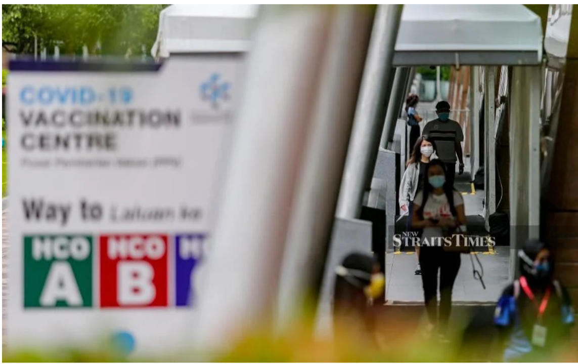
Before reaching the vaccination booths, would-be vaccinees are consulted by a doctor who could determine, explain and advise the necessary.

LETTER: My wife and I did not register early for vaccination against Covid-19 as many others were more in urgent need, particularly frontliners in healthcare, sales, service and those that work alongside with co-workers such as in offices and factories.